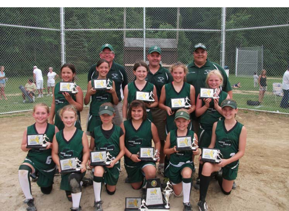
ASA 10U B New York State Tournament Runner-ups Miss Shen Cyclones