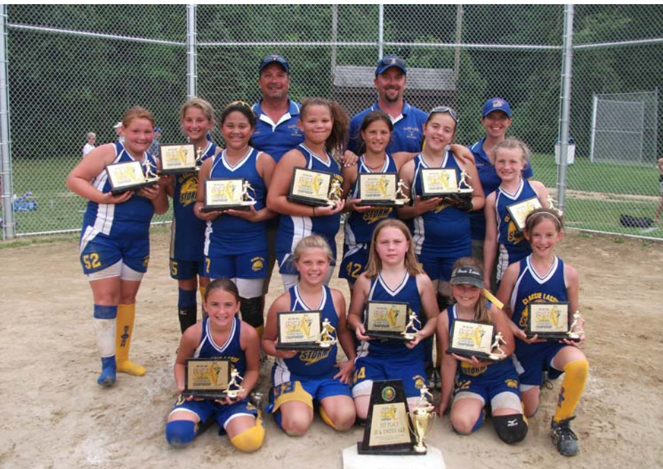
ASA 10U B New York State Tournament Champions Classie Lassie Storm